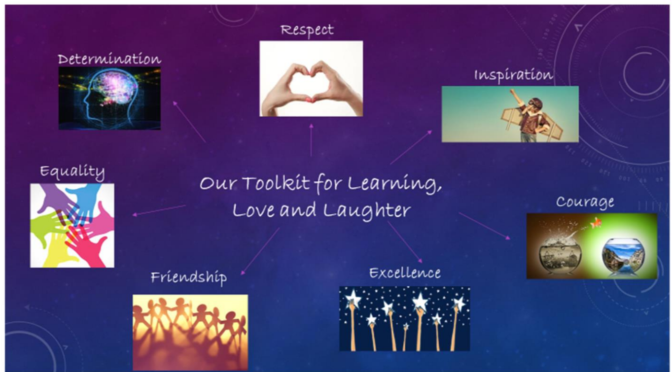
St Breock Whole School Personal Development Overview

This feeds into our whole school Personal Development Curriculum and Our Toolkit for Learning, Love & Laughter, which form our school values and expectations.